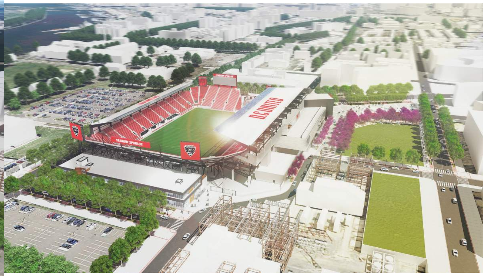
SOUTHEAST AERIAL VIEW