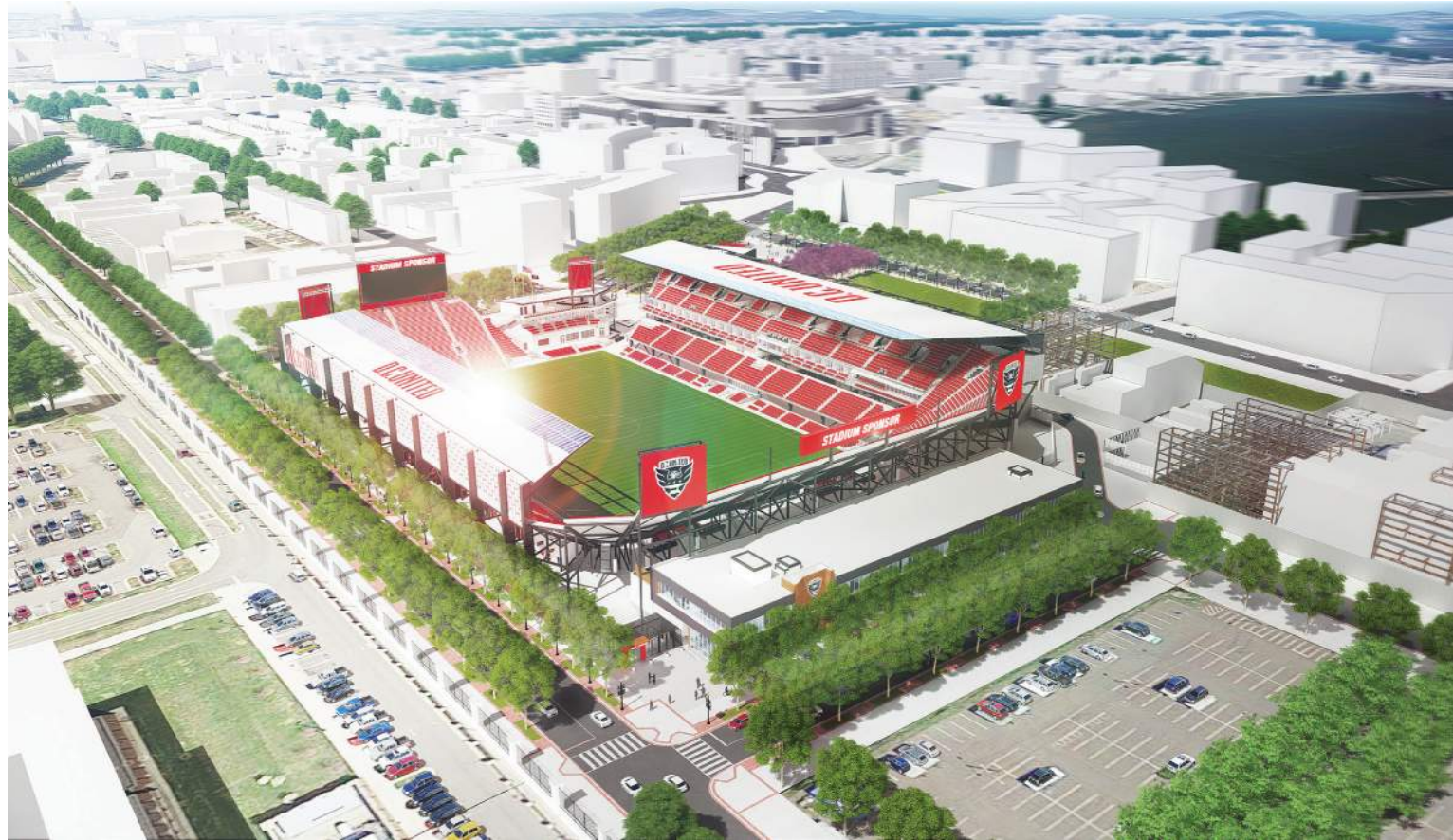
SOUTHWEST AERIAL VIEW