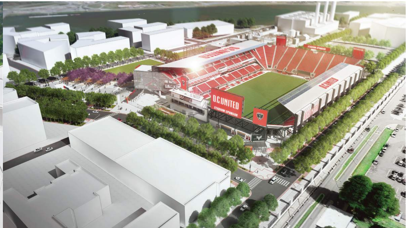
NORTHWEST AERIAL VIEW